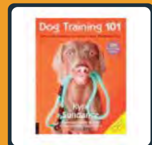
Dog Training 101 Book $24.95