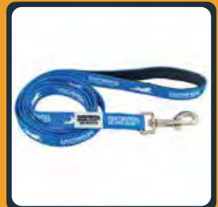
CKC Logo Dog Leash $16.00