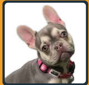
Adjustable CKC Collar $12.00