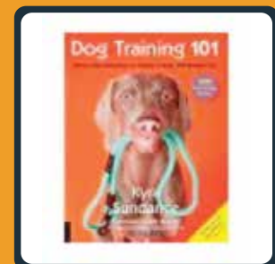
Dog Training 101 Book $24.95