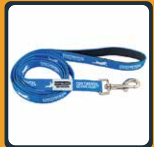
CKC Logo Dog Leash $16.00